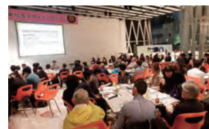
The Science Café