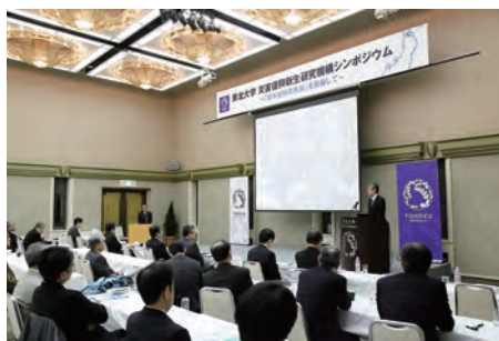
The first symposium of the institute in March, 2013