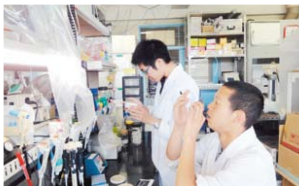
Division of Bioscience and Biotechnology for Future Bioindustries, Graduate School of Agricultural Sciences

JSPS: Japan Society for the Promotion of Science JST: Japan Science and Technology Agency KEK: High Energy Accelerator Research Organization MEXT: Ministry of Education, Culture, Sports, Science and Technology MHLW: Ministry of Health, Labour and Welfare MOE: Ministry of the Environment NEDO: New Energy and Industrial Technology Development Organization