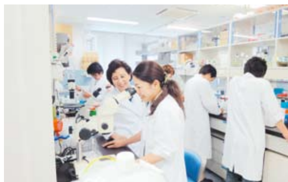
Division of Medical Sciences, Graduate School of Medicine