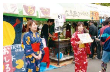
Tohoku University Festival