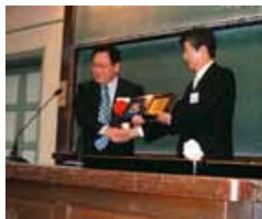
"Tohoku University Lu Xun Award" presented to President Gu Binling of Tsinghua University