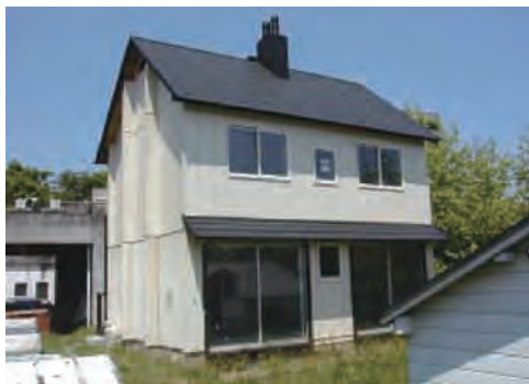
Photo: Experimental house for various research purposes