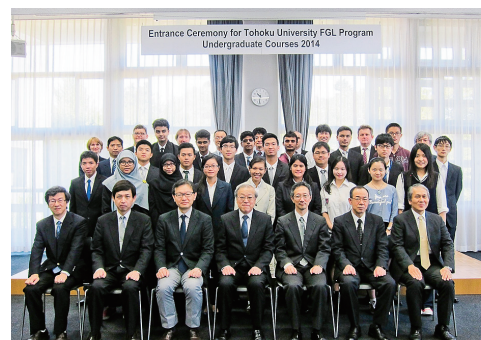
Entrance Ceremony for FGL program