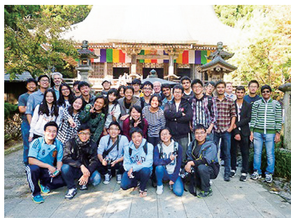
Field trip to Yamagata for FGL undergraduate students