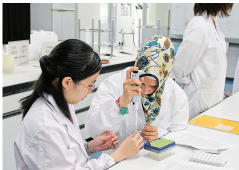
Natural Science Experiment class