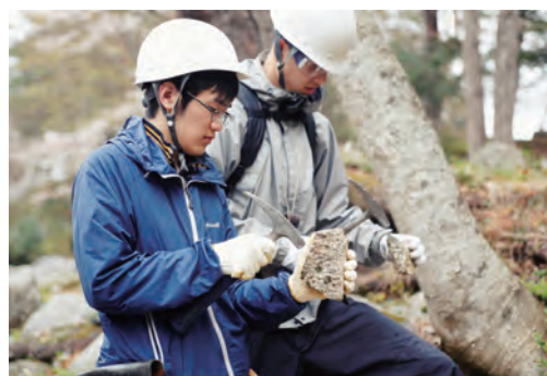
Graduate School of Science