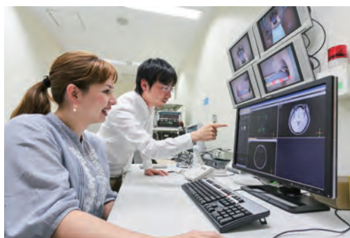
Institute for Development, Aging and Cancer