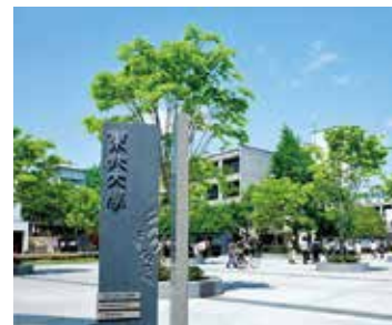
Springtime in Kawauchi Campus