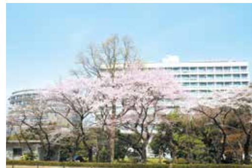
School of Medicine Buildings