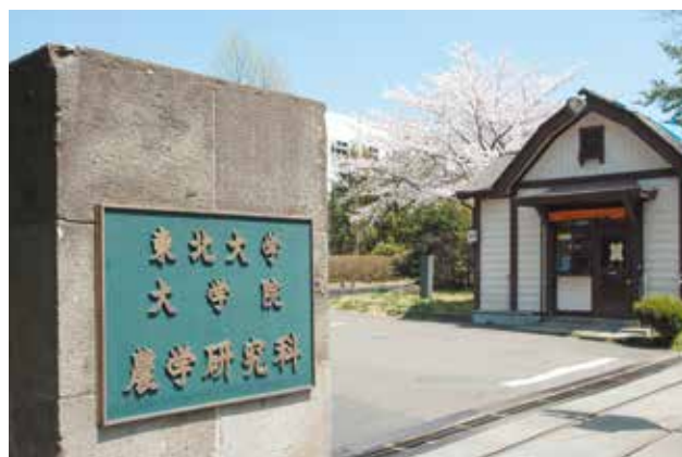
Amamiya Campus Main Gate