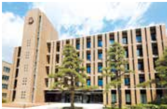
Extended Education & Research Building