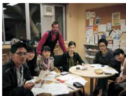
International Students (IPEM)