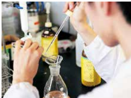
Chemistry Laboratory (IGPAS)

Inquiries: m-daigakuin@bureau.tohoku.ac.jp