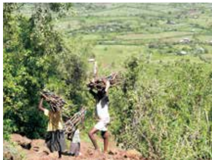
Firewood collection in Gwass Hills Forest Reserve, Western Kenya (IPESS)