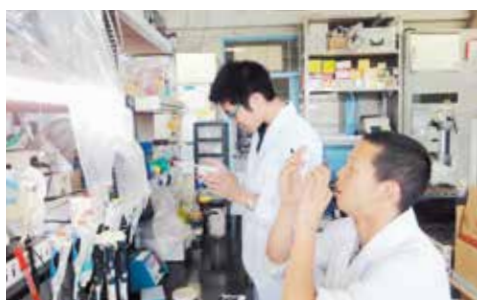
Division of Bioscience and Biotechnology for Future Bioindustries, Graduate School of Agricultural Sciences

JSPS: Japan Society for the Promotion of Science JST: Japan Science and Technology Agency KEK: High Energy Accelerator Research Organization MLIT: Ministry of Land, Infrastructure, Transport and Tourism MEXT: Ministry of Education, Culture, Sports, Science and Technology MHLW: Ministry of Health, Labour and Welfare MOE: Ministry of the Environment NEDO: New Energy and Industrial Technology Development Organization METI: Ministry of Economy, Trade and Industry