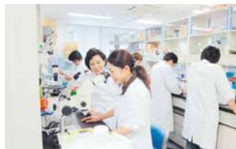
Division of Medical Sciences, Graduate School of Medicine