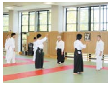
JYPE Aikido Class