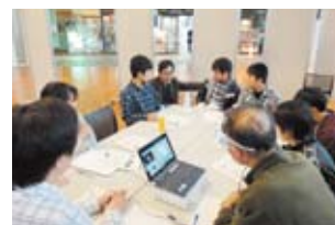
The Science Café in Akita