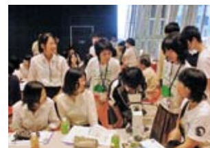
The Science Café