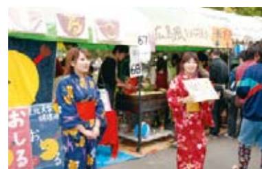
Tohoku University Festival