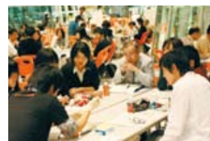
The Science Café