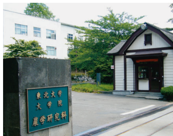
Amamiya Campus Main Gate