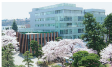
Katahira Sakura Hall