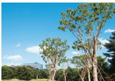
Zelkova transplanted from Aoba Street to Aobayama New Campus