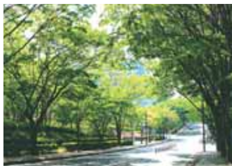
Graduate School of Engineering