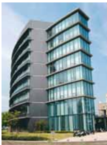
Graduate School of Information Sciences