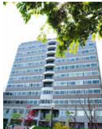
New Humanities Building

Memorial Auditorium / Matsushita Memorial Hall 15