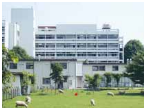
Graduate School of Agricultural Science

* includes Graduate School of Life Sciences