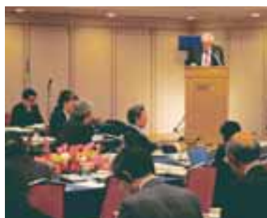
Tohoku University Centenary: The Education Summit "New Knowledge Society"