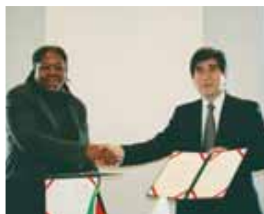
MOU Signing Ceremony with the Independent Development Trust (IDT) in South Africa