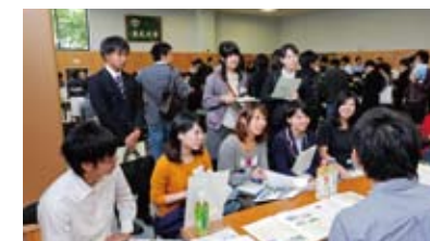
Get-together meeting between current students and graduates