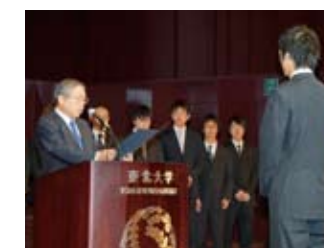
Alumni secretaries elected by confidence vote

The secretaries of the alumni association of the Tohoku University Shuyukai are elected individually according to their year of graduation. They play a role in organizing the Alumni Association to foster a friendly environment in the Tohoku University Community and celebrate two-decade, three-decade etc. milestone. In 2010, the secretaries were elected by confidence vote from the 104th, and 100-102nd classes.