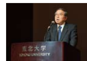
Shuyukai General Meeting

Home Coming Day was planned to provide an opportunity for graduates to meet their old friends and teachers, and current students. The intention of this event is to say "Welcome to your University." Since 2007, Home Coming Day has been held in October every year.