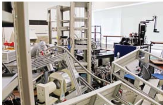
Research equipment damaged (Katahira Campus)