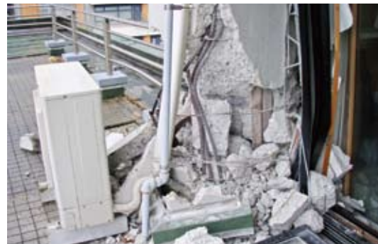
10% of the buildings were severely damaged. (Aobayama Campus)