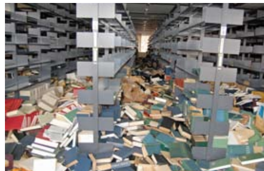
Books scattered around Tohoku University Library (Kawauchi Campus)