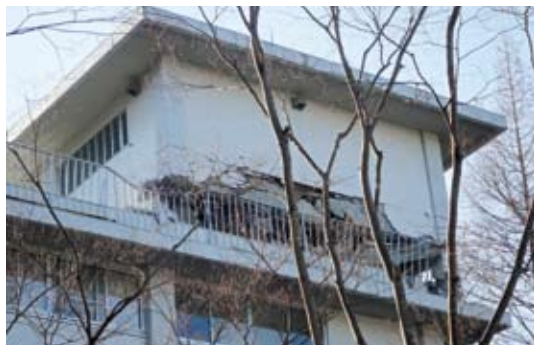
Research building with damaged walls (Kawauchi Campus)

Some facilities and equipment in the university were severely damaged. Some walls were crumbled, and research equipment was destroyed. However, the campuses were safe and there were no injuries among the students and staff. A risk evaluation survey that was implemented afterward indicated that 90% of the buildings were safe to use.