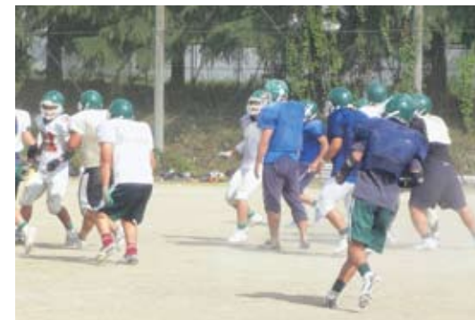
Lively club activities