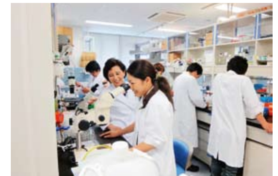
Students undergoing practical training

After the Great East Japan Earthquake of March 11, inaccurate rumors were spread about the effects of the earthquake, tsunami and radioactivity on education/research at Tohoku University.