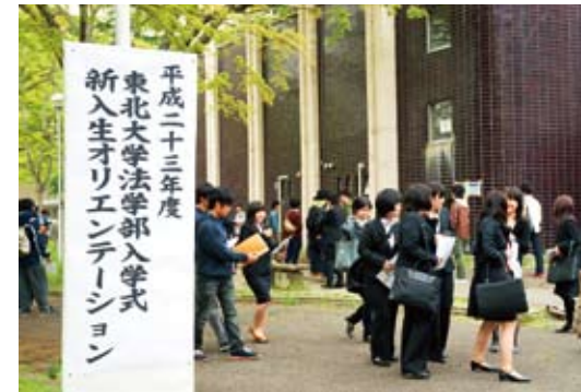
Entrance Ceremony at the faculties and the graduate schools

On May 6, 2011, the Entrance Ceremonies, which had been postponed, were held in each faculty. On May 9, classes were started, and lectures, seminars and practical training have since been resumed. Students are active again in club activities, so the campuses are as lively as they were as before the earthquake.