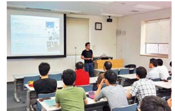
Lectures being conducted as usual