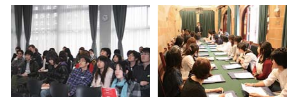
Tohoku University Study Abroad Fair

in partnership with Tohoku University and domestic institutions to support studying abroad. The students who were interested in going abroad had an opportunity to consult with the universities and institutions.