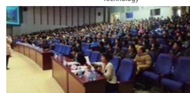
Northeastern University (China)