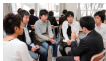
Social gathering for current students and alumni