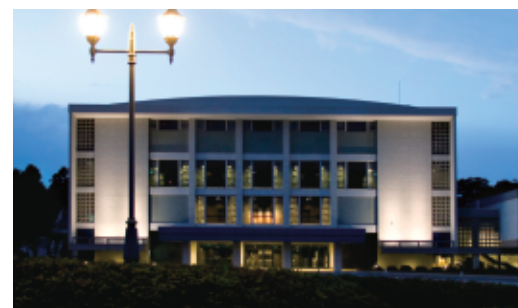
Tohoku University Centennial Hall

Tohoku University Centennial Hall (nicknamed Kawauchi Hagi Hall) was completed in August 2008 as a part of 100th anniversary commemoration projects by remodeling Kawauchi Memorial Auditorium that was established to celebrate the 50th anniversary and Matsushita Memorial Hall.