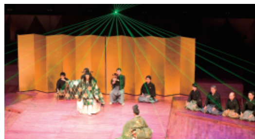
Concert to celebrate the completion of Kawauchi Hagi Hall

◎ Autumn cultural festival by Cultural Clubs