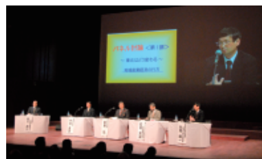
Symposium titled "Local Area and the Automobile Industry"