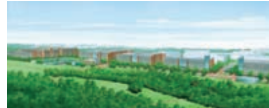
Birds-eye Image of the Campus Mall

This open space is positioned on a hill facing the University Park, overlooking the campus. This is an important point viewed from almost everywhere in the new campus, and is planned together with a building to be a landmark for the entire campus.