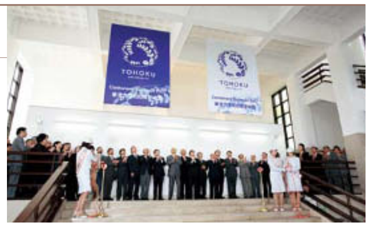
The Pre-Centenary Event - The University's Logo Tapestry Unveiling Ceremony

On June 22nd 2006, Tohoku University held a "Pre-Centenary Event" for its 99th Foundation Day Anniversary. The event included ceremonies to announce Tohoku University's o cial logo motif and also initiated anniversary advertisements on Sendai City Buses. The decorated 100th Anniversary Bus, with the aim of promoting our centenary projects, was launched to mark this auspicious occasion with the following major projects: the establishment of the Tohoku University Foundation, the publication of a Centenary History Book, the restoration of the Memorial Auditorium and a range of commemorative events (the 100th anniversary campaign).