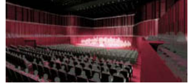
The Academic Hall to be established. (CG image)

The "Tohoku University Ninomaru Hall" (its provisional name) will join the symbols of the Academic City of Sendai. The existing "Memorial Auditorium" and the "Matsushita Memorial Hall" at the Kawauchi Campus will be subject to restoration and will be converted into new facilities. They shall be provided with advanced technologies which include a concert hall, conference rooms, an exhibits gallery, a faculty club, etc.