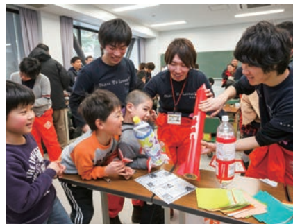
Scene from the “Rocket Classroom”

On February 11, 2013, the Hosting of “NHK Public Recording ‘Disaster Recovery Support for the Future’ at Tohoku University” was held at the Kawauchi Campus with 5,400 audiences taking part in many different programs.