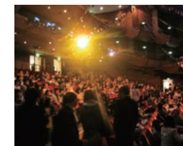
Performance of “Cats” held exclusively for Shuyukai members

On this day, over 900 Shuyukai “Premium Members,” including alumni, faculty and staff, current students and their families, attended this performance. The two and a half hour musical passed by swiftly as the audience watched mesmerized, clapping to the beat of the music and laughing out loud with joy. Although the members of the audience came from different walks of life, on this day, everyone was united as they shared the thrill and excitement of this special time.