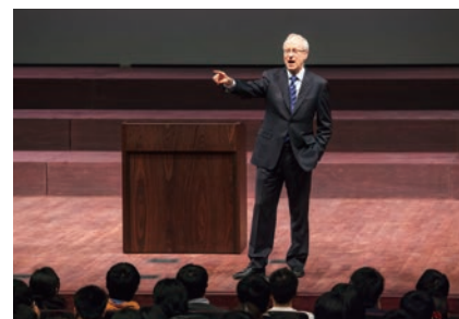
Professor Michael Sandel