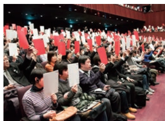
Answering a difficult question from Professor Sandel

At the lecture, Professor Sandel asked difficult questions such as “Do you think social workers or firefighters should put their lives at risk at times of disasters?” or “Which do you think is more important, taking speedy action for reconstruction, or getting everyone to agree on the right action even if it might take longer?” You can view this lecture on Tohoku University's video channel on YouTube.