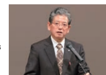
Shuyukai general meeting