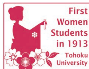
Logo commemorating 100th anniversary of first women students at Tohoku University

Various activities to promote gender equality have been carried out throughout 2013 to commemorate the 100th anniversary of the first women to study at Tohoku University. On August 8, 2013, as part of our commemorative activities, a symposium was held on the theme “100 Years since the First Women Scientists Studied at Tohoku University and Fostering Future Female Leaders” with the participation of top female scientists from throughout Japan and the world. In addition, a 10-year “Action Plan” was announced to promote gender equality by fostering female leaders and scientists for the next generation and supporting faculty and staff members who want to work while raising a family.