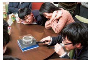
Science Café Special Program

As part of Tohoku University's activities, a “Water Rocket Workshop” for children was conducted by FROM THE EARTH, a group from the Students' Friendship Association. The children made their own water rockets and launched them. They also launched rockets with the use of explosives. In addition, three special programs of “Science Café” have been offered. “Science Café” is usually held once a month at the Sendai Mediatheque in order to help people in the local community learning the joy of science.