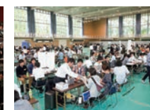
Get-together meeting between current students and graduates