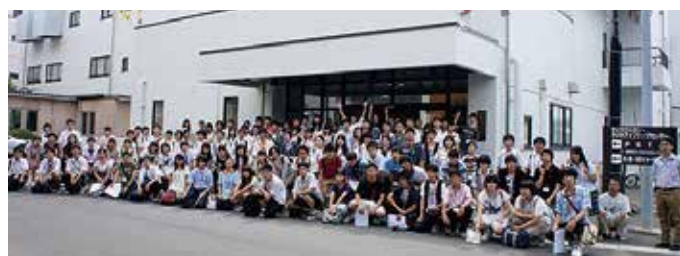
High school students in the science program

Tohoku University operates a program to help high school students pursue their interest in science by engaging them in science lectures, field studies, and laboratory experiments. This program is part of a project initiated by the Japan Science and Technology Agency to foster the next generation leaders in science and technology. The University recruits 100 local high school students every year, 70 of whom are assigned to a basic course and 30 to an advanced course. In both courses, professors of the University's graduate schools in sciences assist them in cultivating scientific minds—exploring the wonder around us, analyzing and summarizing their findings in reports and making presentations; and reading science materials in English.