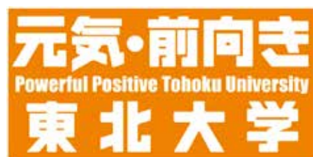
Official logo of the PR campaign

Tohoku University conducted a Recovery PR campaign under the slogan "Powerful Positive Tohoku University" to keep people in Japan and abroad updated on the progress that the University was making in recovering from the earthquake. We posted video clips and presentation materials on a special section of our website.