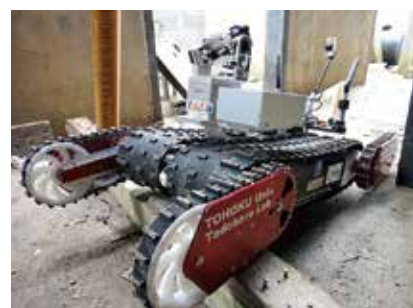
The Quince robot

We set up air-dose monitoring devices at four locations in the campus and at seven locations in Miyagi Prefecture, and kept students and local residents updated on the monitoring results. We also provided local governments with radiation data on vegetables, drinking water, air, soil, and seawater. Moreover, the University assisted Fukushima City in decontaminating soil within the fallout area.