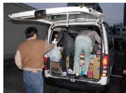
University hospital staffers loading medical supplies into a van

Medical staffers from the Tohoku University Hospital rushed to affected communities to tend the injured. Critical patients were flown to the hospital by helicopter for treatment.