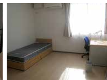
A semi-furnished dorm room measuring 15 square meters