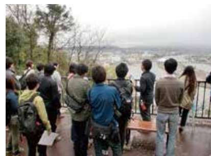
Tour to an affected community, organized by the Student Volunteer Support Center

Quince, a robot that Tohoku University co-developed with the Chiba Institute of Technology to probe hazardous sites in disaster areas, was set to work at the Fukushima No.1 Nuclear Power Plant. The robot measured radiation dose rates inside the damaged reactor buildings and took photographs.