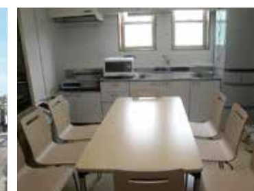
Shared living room space in the dormitory