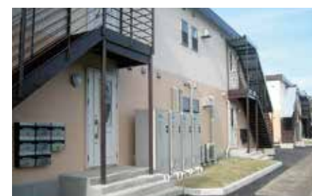
Temporary dormitory on Kawauchi Campus